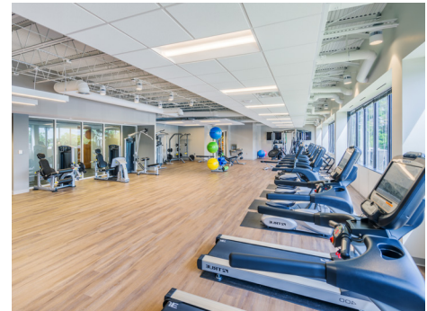
NEW FITNESS CENTER, CONFERRING SPACE & CANTEN